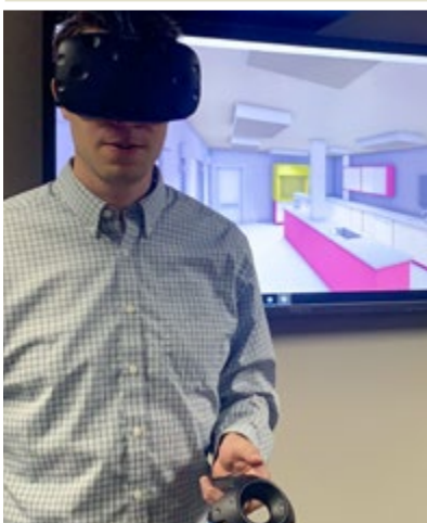
Virtual reality goggles provide a "real life" experience for the viewer.