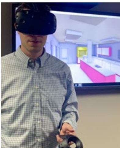
Virtual reality goggles provide a "real life" experience for the viewer.